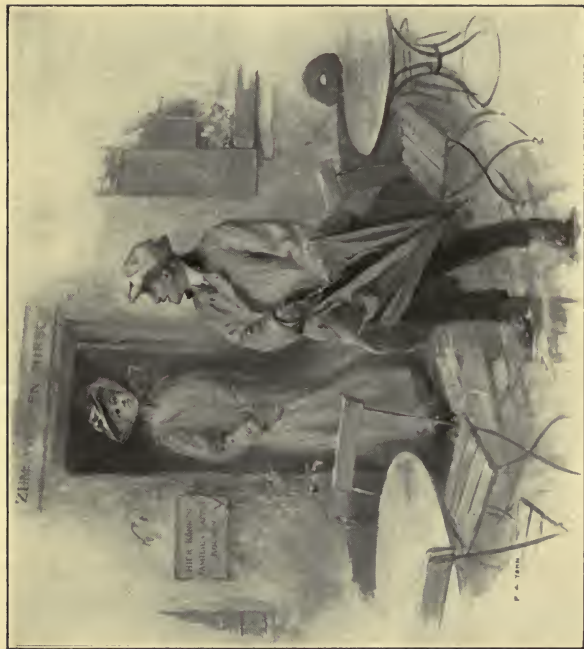
“Like a pair of joyous and irresponsible children . . . too happy even to pause and ask themselves whither they were going.”